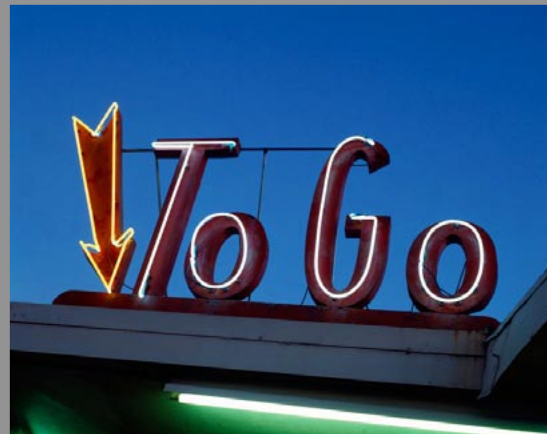
"To Go" window, Earl Abel's, San Antonio, Texas.

Join the Society for Commercial Archeology and become a member of the oldest national organization devoted to the commercial-built environment.