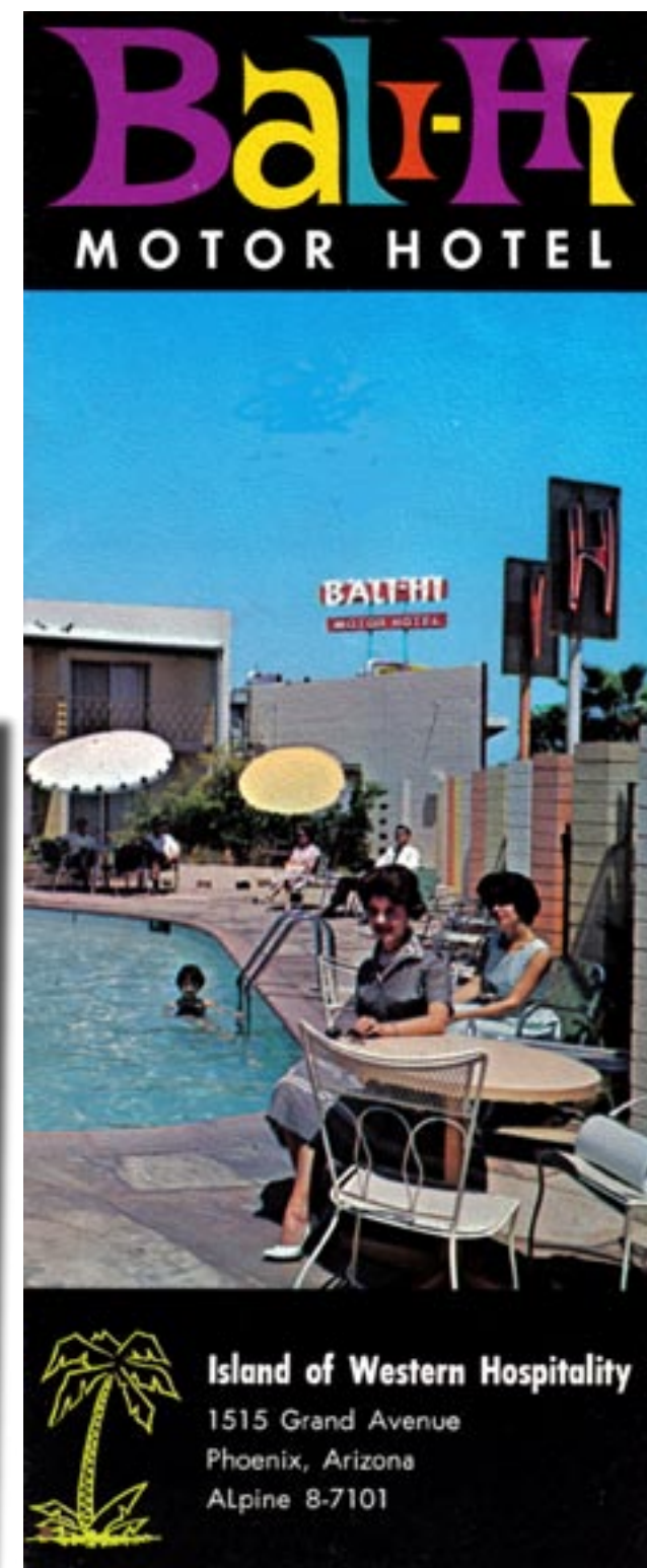
OPPOSITE: Matchbook cover from Egyptian Motor Hotel. THIS PAGE: Brochures from Hotel Desert Sun and Bali Hi Motor Hotel.