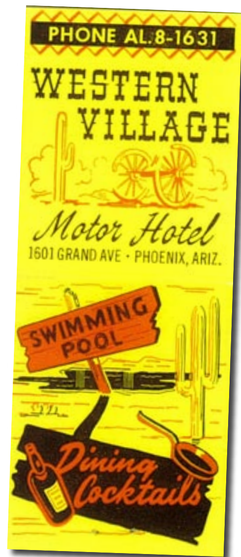
ABOVE: The vacant Western Village Motor Hotel burned in 1990, leaving only remnants like this matchbook cover. BELOW: A matchbook cover from Fletcher Jones Chevrolet.